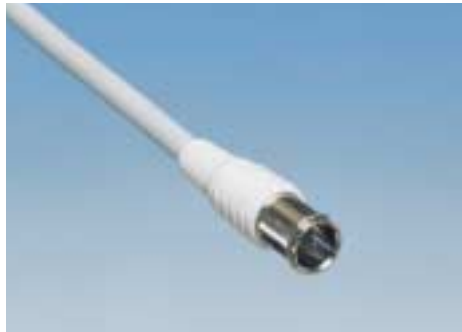
Straight one-touch connector