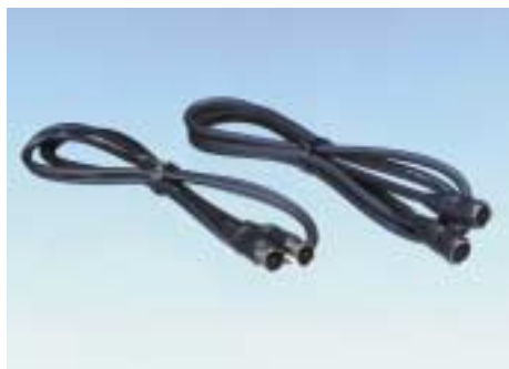
RF cord, S-terminal connector code