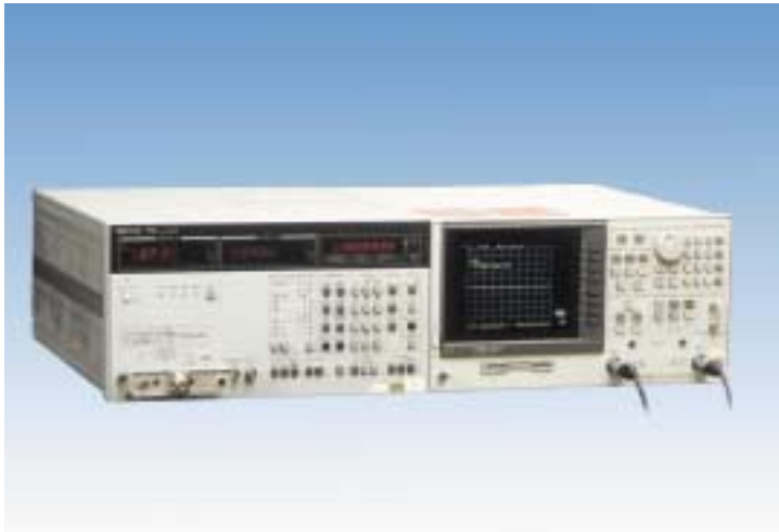
Network analyzer 8753D (Manufactured by Hewlett-Packard Co.) Impedance analyzer 4192A (Manufactured by Hewlett-Packard Co.)