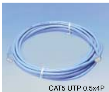
Category 5 modular assembly