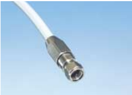
Completely waterproof connector