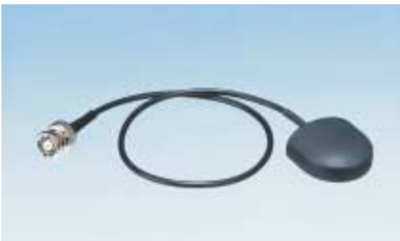
GPS antenna (example of use)