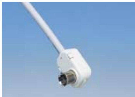
L-shape one-touch connector

In addition to above, various types of connectors are available.