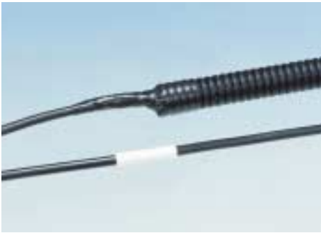
Mounting harness for PVC tape/ corrugated tube