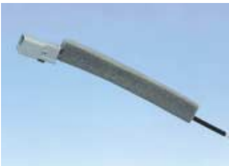
Mounting harness for soft tape

We manufacture harnesses for various connector assemblies. We manufacture custom products to meet user specifications.