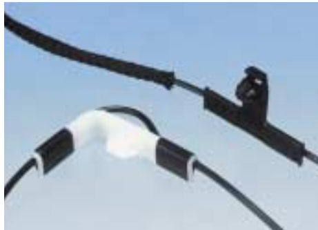
Mounting harness for clip