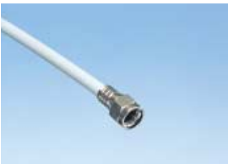
Pinless waterproof round-caulking connector